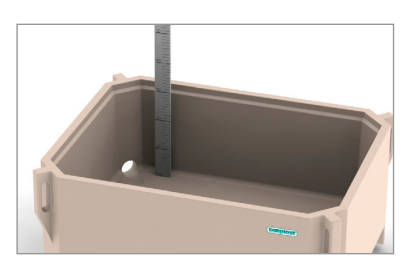
Low wall height ensures low pressure on products