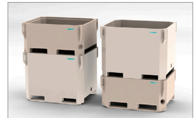
Interstackable with SÆPLAST 310.