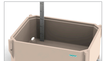
Low wall height ensures low pressure on products.