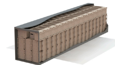
Easy shipping – up to 244 SÆPLAST tubs in a 40 HC container.