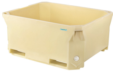
PUR SÆPLAST 460