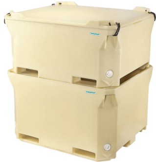
SÆPLAST 460 and 660 are interstackable.