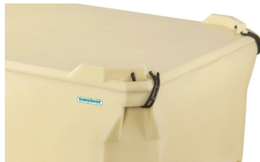
SÆPLAST 460 and 660 PUR are available with an optional lid.