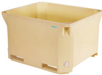
PUR SÆPLAST 660