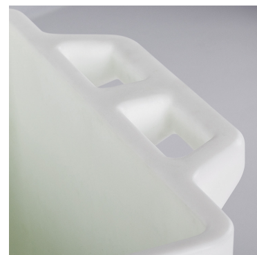
Ergonomically designed handles.