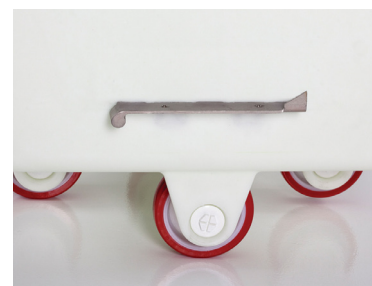
Integrated stainless steel brackets.